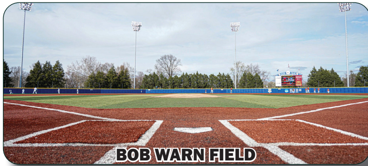
BOB WARN FIELD

Games are played at 2:30 and 6 pm (ET) on Tuesday and 9 am, 12:30 pm, 4 pm and 7:30 pm (ET) on Wednesday and Thursday. Friday's games will be played at 11 am, 2:30 pm and 6 pm (ET) and Saturday will feature the championship game at 2:30 pm (ET) and the "if necessary" game would follow at 6 pm (ET). Every game during the five-day event will be available live on ESPN+.