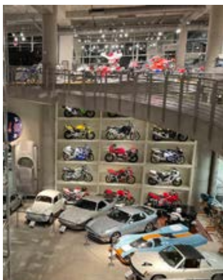
» Barber Vintage Motorsports Museum

2630 Cahaba Rd, Birmingham birminghamzoo.com