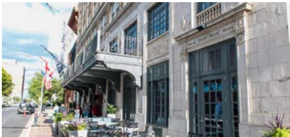
» Historic Redmont Hotel Birmingham