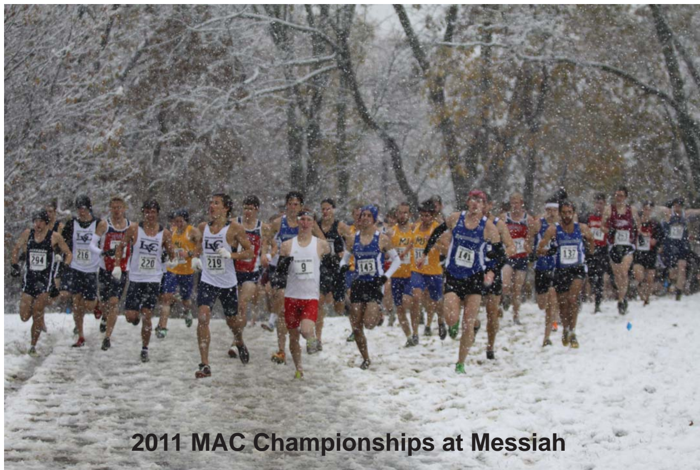
2011 MAC Championships at Messiah