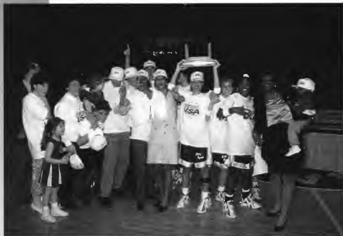
Memphis won the inaugural women's basketball tournament championship.