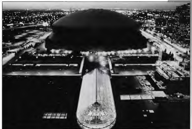
Louisiana Superdome (70,892)

Basic Offense: .....Multiple Basic Defense: .....4-3 Lettermen Returning/Lost: .....47/16 Starters Returning: .....19 Offense .....10 Defense .....8 Specialists .....1 1995 Record: .....2-9-0 Postseason: .....None All-Time Record: ....422-476-36 (.471) Bowl Appearances: .....8 Bowl Record: .....2-6-0 Last Appearance: ..1987, Independence