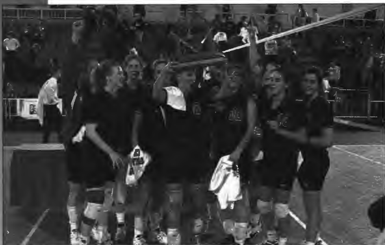
South Florida celebrates its first C-USA volleyball championship.