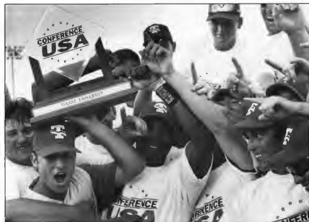
Tulane claimed its first C-USA baseball championship.