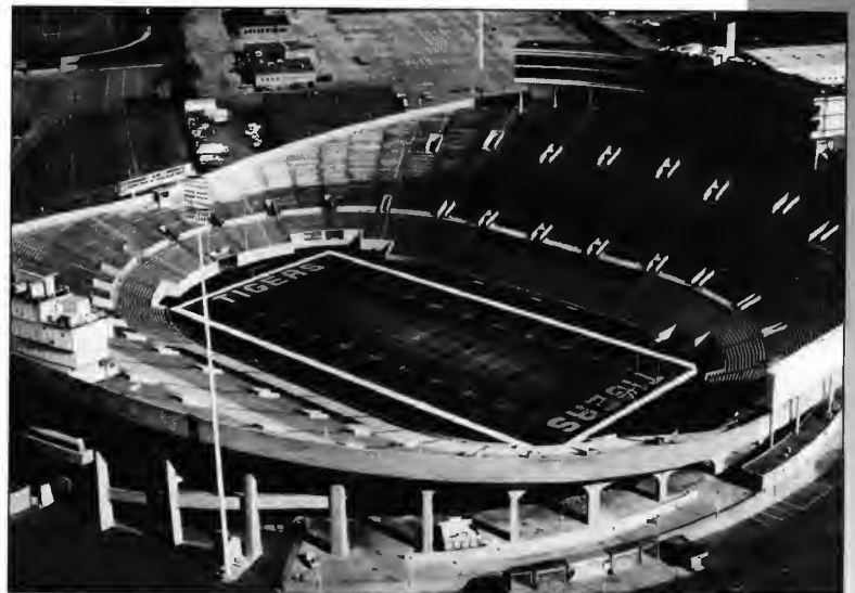
Liberty Bowl (62,380)

Basic Offense: . . . . . Multiple Basic Defense: . . . . . 4-3 Lettermen Returning/Lost: . . . . . 41/18 Starters Returning: . . . . . 15 Offense . . . . . 6 Defense . . . . . 6 Specialists . . . . . 3 1995 Record: . . . . . 3-8-0 Postseason: . . . . . None All-Time Record: . . . . . 363-362-32 (.501) Bowl Appearances: . . . . . 2 Bowl Record: . . . . . 2-0-0 Last Appearance: . . . . . 1971, Pasadena