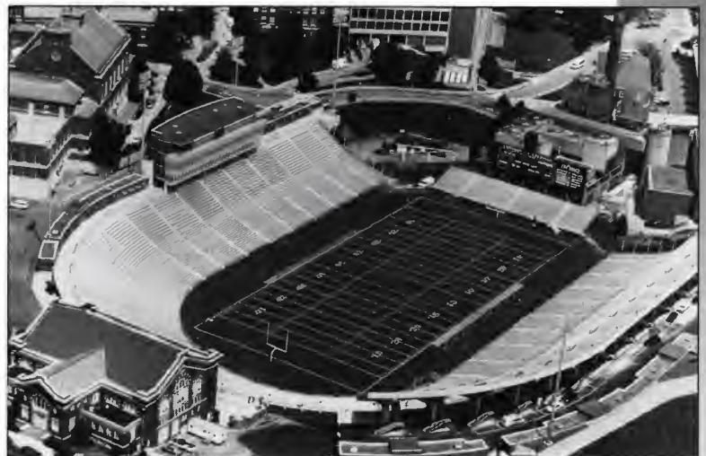
Nippert Stadium (35,000)

Basic Offense: .....Pro Set Basic Defense: .....4-3 Multiple Lettermen Returning/Lost: .....44/18 Starters Returning: .....13 Offense .....4 Defense .....7 Specialists .....2 1995 Record: .....6-5-0 Postseason: .....None All-Time Record: ...450-468-51 (.491) Bowl Appearances: .....3 Bowl Record: .....2-1-0 Last Appearance: .....1950, Sun