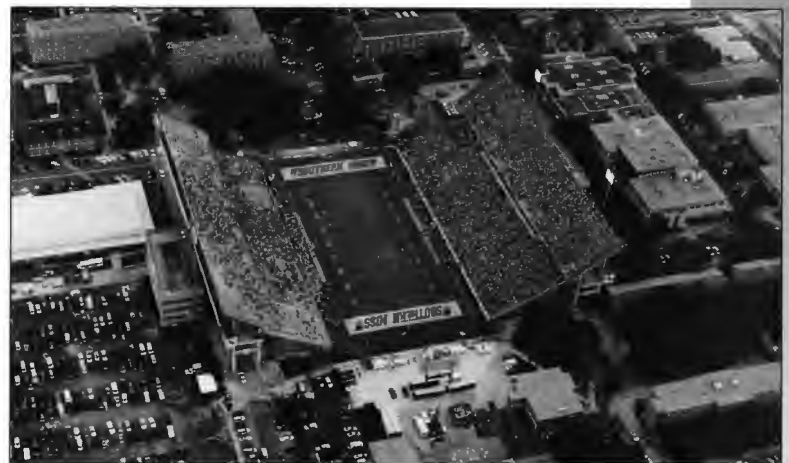
M. M. Roberts Stadium (33,000)

Basic Offense: .....Multiple Basic Defense: .....Multiple Lettermen Returning/Lost: .....47/15 Starters Returning: .....15 Offense .....9 Defense .....6 Specialists .....0 1995 Record: .....6-5-0 Postseason: .....None All-Time Record: ....432-297-27 (.589) Bowl Appearances: .....8 Bowl Record: .....2-6-0 Last Appearance: ..1990, All-American