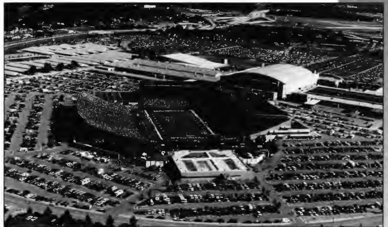
Cardinal Stadium (35,500)

Basic Offense: .....Multiple Attack Basic Defense: .....Multiple Lettermen Returning/Lost: .....35/14 Starters Returning: .....14 Offense .....5 Defense .....7 Specialists .....2 1995 Record: .....7-4-0 Postseason: .....None All-Time Record: ...338-359-17 (.485) Bowl Appearances: .....5 Bowl Record: .....3-1-1 Last Appearance: .....1993, Liberty