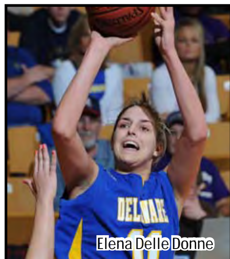
Elena Delle Donne