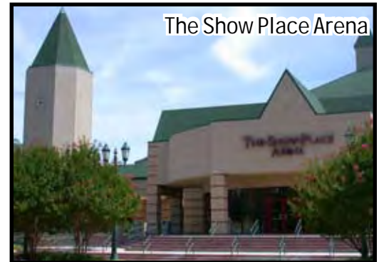
The Show Place Arena

The Show Place Arena in Upper Marlboro, Md. has been selected to host the Colonial Athletic Association Women's Basketball Championship in 2011 and 2012 by the league's athletic directors. It will be the first time that The Show Place Arena has served as host of the CAA women's championship. All games in the four-day, 11-game tournament will be played at the 5,000-seat arena, with the winner earning an automatic bid to the NCAA Tournament.