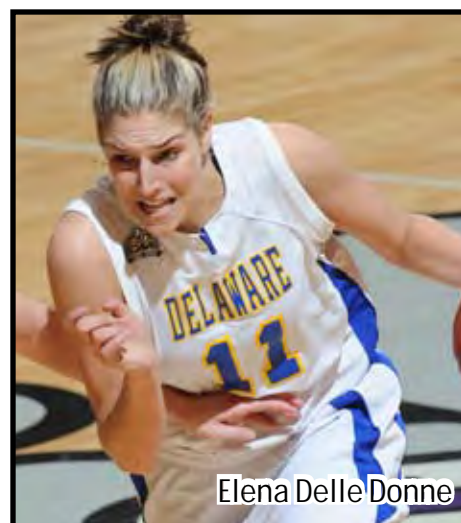
Elena Delle Donne