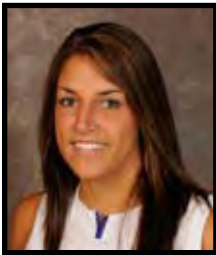
Elena Delle Donne