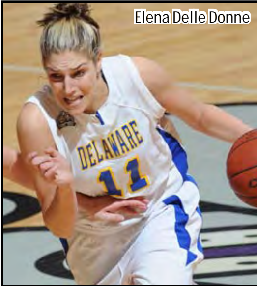
Elena Delle Donne