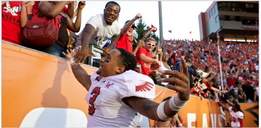
Vernon Adams and Eastern Washington shocked the college football world in 2013, after the Eagles upset 25th-ranked Oregon State in Corvallis. Adams threw for 411 yards and rushed for 107 in the 49-46 upset.