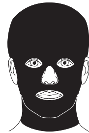
430 Face Mask