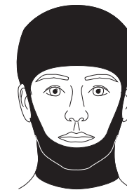
431 Open Face Mask