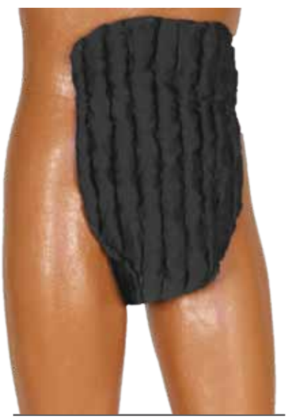
GeniFit™ Male High Cut Pad