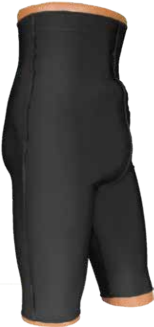
CompreShorts™ (shown with male low-cut GeniFit™ pad)

10 - 15 mmHg | Comfortable support & Mild Compression