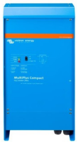
MultiPlus Compact 12/2000/80

When connected to the Ethernet, systems with a Color Control panel can be accessed and settings can be changed.