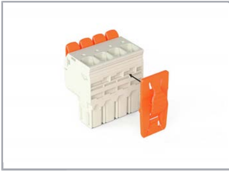
Locking lever; for field assembly