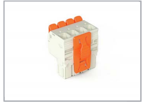
Locking lever; for field assembly