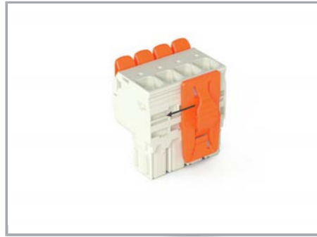
Locking lever; for field assembly