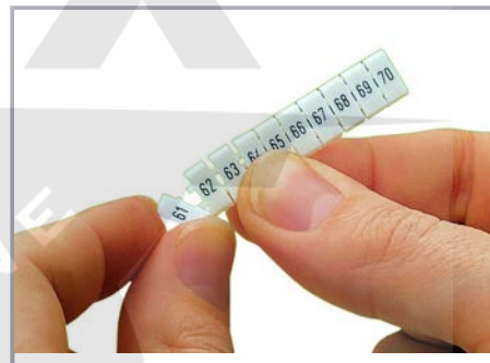
Separating an individual marker from the WMB marker strip – for larger terminal blocks.

Subject to changes. Please also observe the further product documentation!