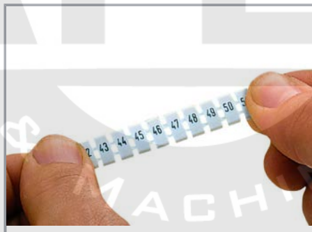
Stretching a WMB marker strip.