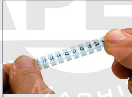
Stretching a WMB marker strip.