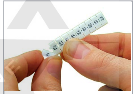
Separating an individual marker from the WMB marker strip – for larger terminal blocks.

Subject to changes. Please also observe the further product documentation!