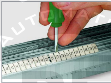
Snapping a marking strip into the marker slot.