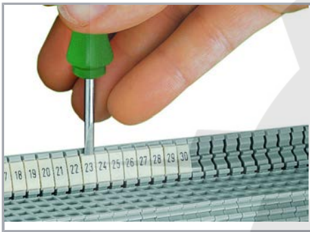
Snapping a WMB marker strip into the marker slot of the double marker carrier.