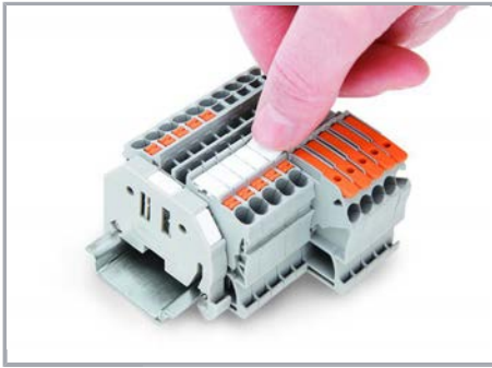
Snapping a marking strip into the marker slot.