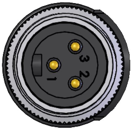
DETAIL A SCALE 2 : 1