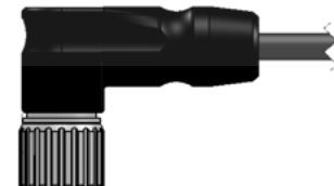
Female (Female Threads) Plug