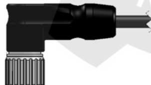
Male (Female Threads) Plug