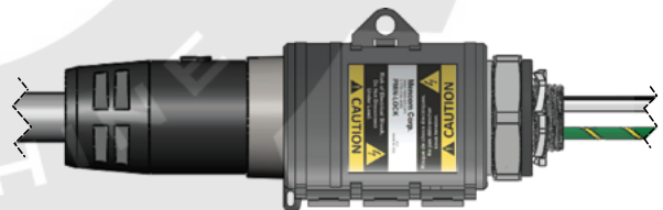
PMIN Plug to Receptacle