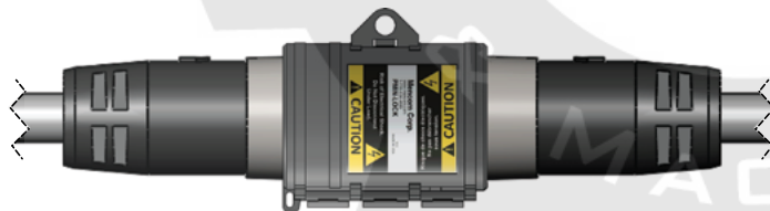
PMIN Plug to Plug

PMIN-LOCK is designed to secure the connection between two straight PMIN plugs or between a straight PMIN plug and a mating receptacle. To open lock, insert small flat blade screwdriver into slot below padlock hole.