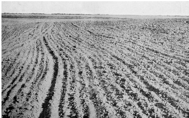
Figure 2. A dry-farm field ready for planting in Park Valley, Utah in 1911.

wide frame fixed with large spikes hanging toward the ground (Schillinger and Papendick 2008). Harrowing was used to pulverize the soil surface and break any capillary action which might allow water to evaporate (figure 2; Scofield 1907; Schillinger and Papendick 2008). Half of the field was kept in this harrowed state for a season to accumulate and “store” water while the other half was planted (Buffum 1909; Peffer 1972). The idea was that if no other plants were allowed to use the soil moisture, all of it would be available to the crop planted on the site. Thereby, dry farming only used water stored in the soil from precipitation without additional irrigation.