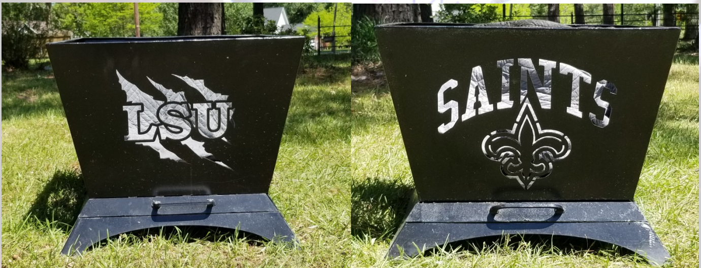
LSU Fire Pit

Currently we are Raffling off a choice of either a LSU or New Orleans Saints Fire Pits