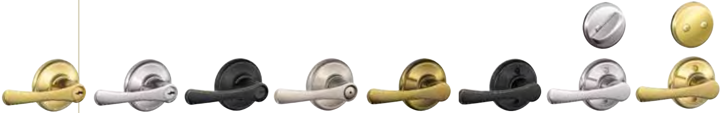
F51 F54 F80 F40 F10 F170 F59 F94

To order Latches, see Parts section page Parts-3 & 4. To order Strikes, see Parts section page Parts-5.