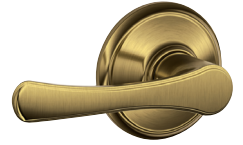
609 Antique Brass