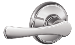
625 Bright Chrome