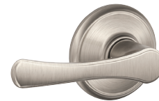
619 Satin Nickel