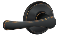
716 Aged Bronze

Visit: www.schlage.com for more information.