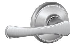
626 Satin Chrome