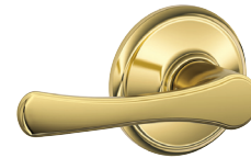
505/605 Bright Brass