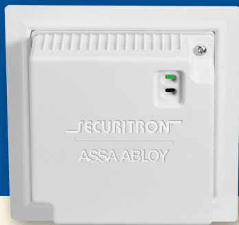
EcoPower 0.5A Power Supply