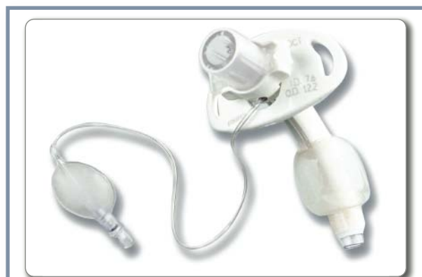
Figure 1 Shiley tracheostomy tube cuffed with disposable inner cannula (DCT).

No studies have been done to determine the optimal frequency for cleaning the inner cannula; however, the cannula should be inspected regularly, perhaps at least 3 times per day, depending on the volume and thickness of the patient's secretions. 21,25 Burns et al 26 maintain that inner cannulas do not need to be changed at all; however, their study had some limitations and was restricted