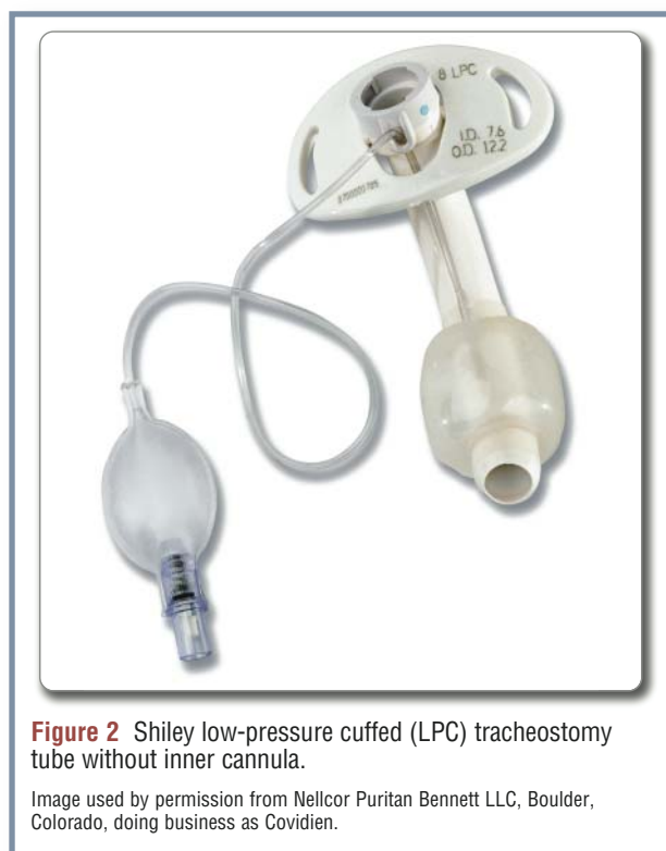
Figure 2 Shiley low-pressure cuffed (LPC) tracheostomy tube without inner cannula.

One of the most important aspects of care for any patient with a tracheostomy is mobilization of secretions.