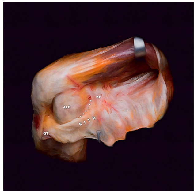
Fig. 1 The anterolateral complex. View of a layer-by-layer dissection of the left knee, demonstrating the key structures of the anterolateral complex. The superficial iliotibial band (SITB) inserts on a wide area of the proximal tibia that includes Gerdy's tubercle (GT) anteriorly, as well as the anterolateral and lateral proximal tibia. The Kaplan fibers (KF) connect the SITB to the distal femoral metaphysis and lateral condyle. The anterolateral capsule (ALC) contains superficial and deep layers, with the lateral collateral ligament (not pictured) located between the two layers. The two capsular layers merge into one layer anteriorly. The capsulo-osseous layer of the ITB (denoted by asterisk ) is continuous with the lateral gastrocnemius muscle fascia and the lateral femoral epicondyle proximally, and then merges with the ITB distally and inserts midway between the fibular head and GT. Some authors have suggested that the structure commonly described as the anterolateral ligament could be the capsulo-osseous layer of the ITB or the confluence of the superficial and deep layers of the anterolateral capsule. Picture reproduced with permission of Elmar et al. ALC pictorial essay, KSSTA 2016 submitted

Amis I believe that all of these structures make some contribution to knee stability, particularly what is known as ‘anterolateral rotatory instability (ALRI).’ However, that pattern of instability and its prevention also depends on the integrity of the ACL. Recent robot work by Kittl et al. measured the contributions of some of the structures listed, and they found that the ITB and its attachments to the femur and anterolateral tibia were the most important. The