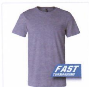
DEEP HEATHER BELLA+CANVAS ULTRA FINE S/S TEE