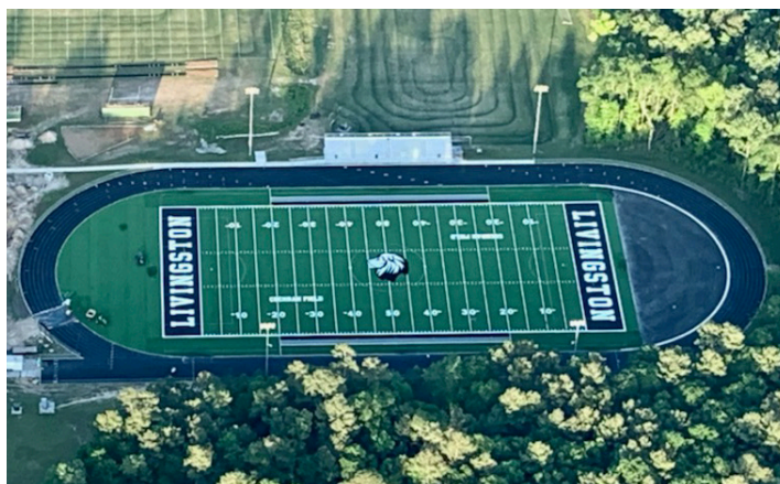
Aerial view of the LHS Cochran Field.

In addition to the approval of minutes from previous board meetings, financial statement, and payment of bills was the purchase of track surfacing and sealant from Quality Courts for $222,404 and Protect Tracks for $188,900. Also approved was the Athletic Insurance Renewal