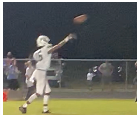
Lions defeat Shepherd 32-26 on a game winning touchdown in the final seconds.

Another area that we are excited about is the partnership between LISD and LivCom. Livcom has allowed our students an opportunity at impactful learning in the area of broadcast like never before. We are in Beta stage of television programming and the students and staff are excited for the opportunity to enhance our community and allow these young folks to obtain some remarkable experiences. The district will release more information on the television station in the future.