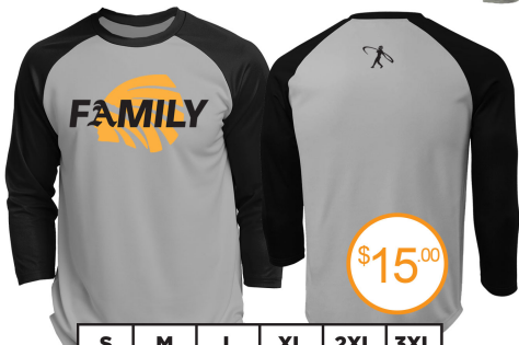
Performance Long Sleeve