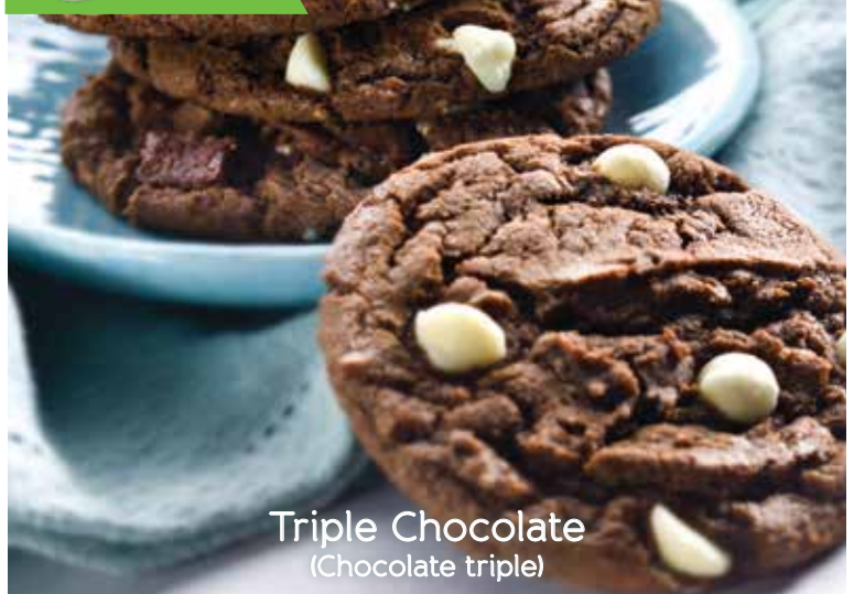
Triple Chocolate (Chocolate triple)