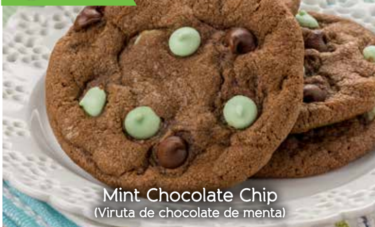
Mint Chocolate Chip (Viruta de chocolate de menta)