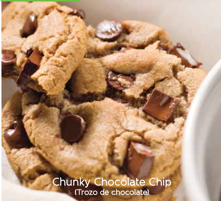
Chunky Chocolate Chip (Trozo de chocolate)