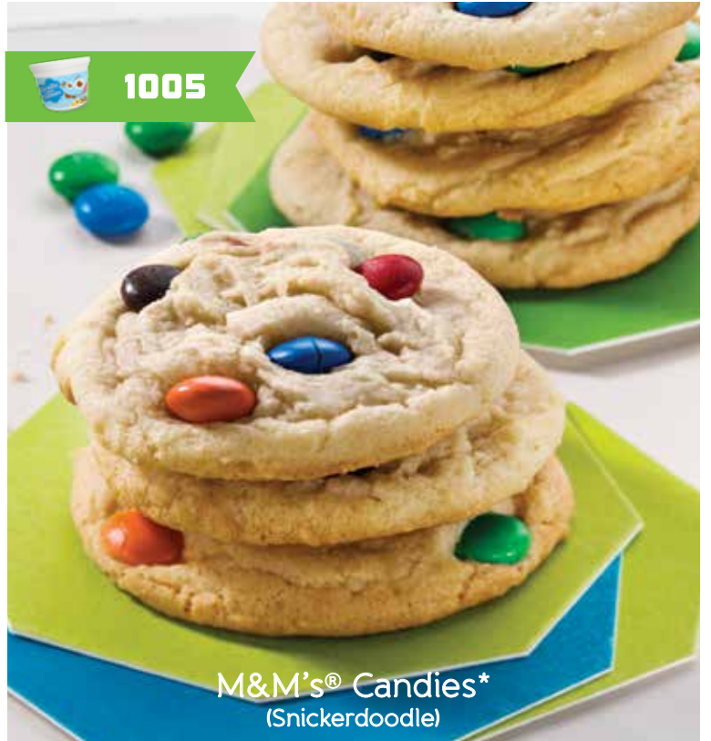
M&M's® Candies* (Snickerdoodle)