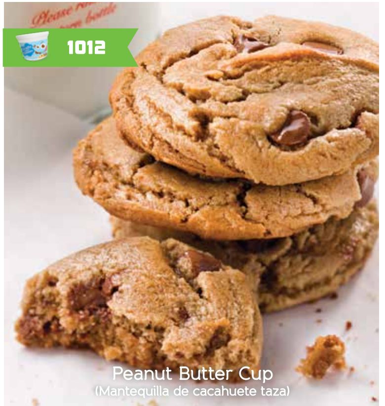
Peanut Butter Cup (Mantequilla de cacahuete taza)