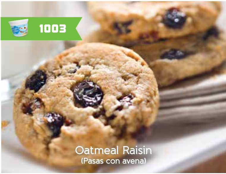
Oatmeal Raisin (Pasas con avena)