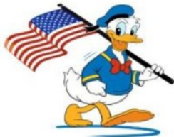
MAY 28th MEMORIAL DAY

THIS INSTITUTION IS AN EQUAL OPPORTUNITY PROVIDER