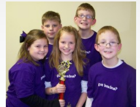
Our K-5 programs are regularly recognized at the state level.