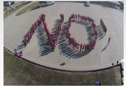
CMS Students JUST SAY “NO” to DRUGS!

Centerpoint Middle School offers a variety of programs for students including Gifted and Talented, Quiz Bowl, Athletics, Music, Art, and Band. Teachers and staff are in constant contact with parents through our website, Remind 101, school social media, and