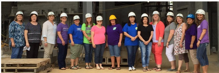
Several teachers touring the new K-5 facility, due to open in the fall of 2017!