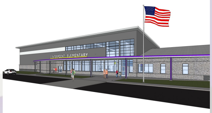
Opening fall of 2017!!