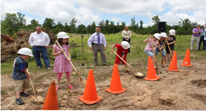
CES Students at the round breaking ceremony for new K-5 Campus