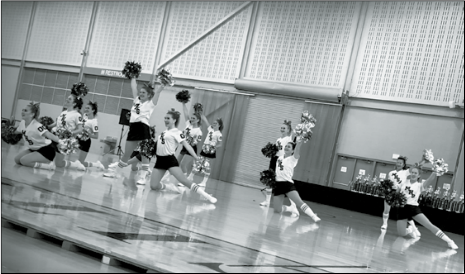
Pictured above is the Marlow High School Bootleggers performing at state competition.