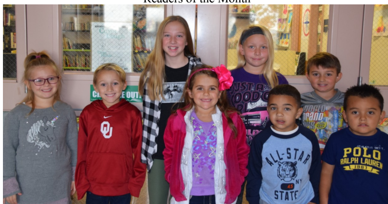
Students of the Month