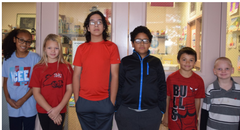
Readers of the Month

Dec. 4-8: Chatty Basketball Tournament TBA