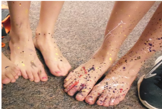
Students show off their splatter-painted feet.

Permission forms for the after school program were sent home last week. These forms must be on file in the office before students can enjoy the many enriching activities provided in the program. Monday marks the first day of the 2015-16 session.