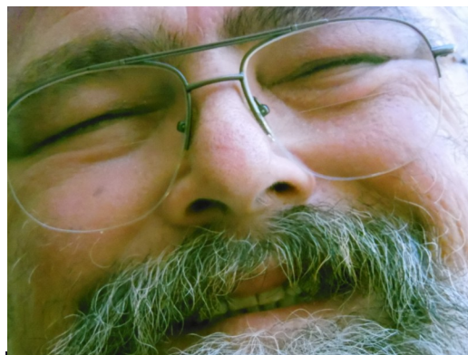
Faculty enjoy their work at Indianoma Schools!

➔ Fall sports: cross country, softball and baseball team & individual pictures will also be taken on Friday. Don't forget your uniforms!