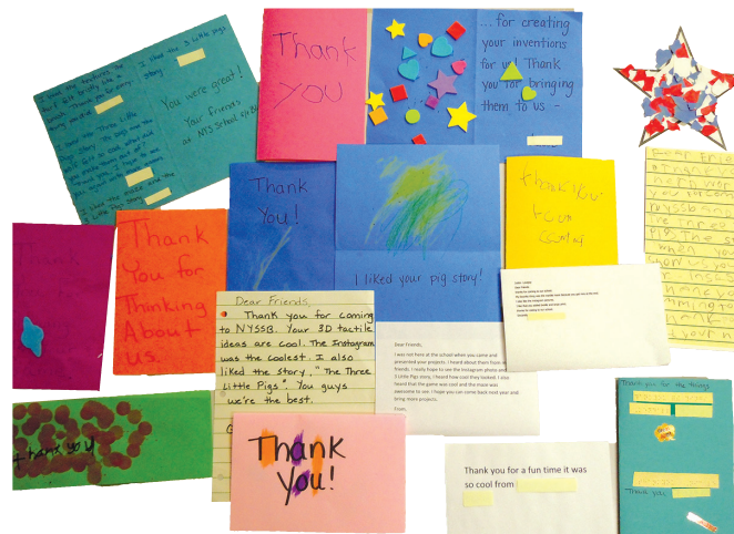
Thank you cards from students of the NYS School for the Blind.