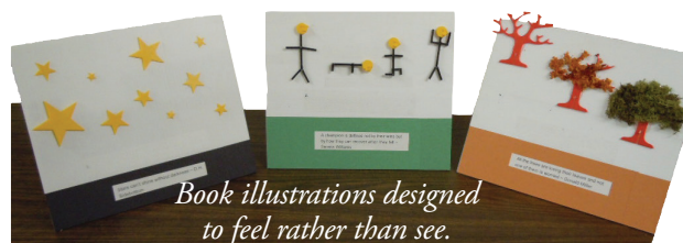
Book illustrations designed to feel rather than see.