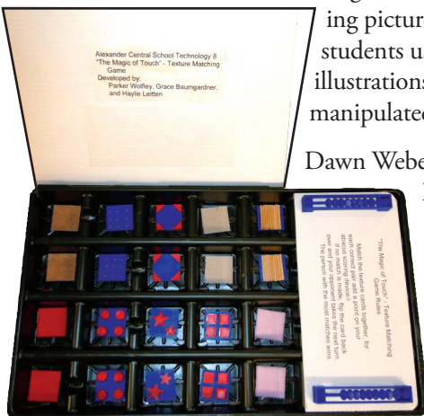
Manipulative game of memory.