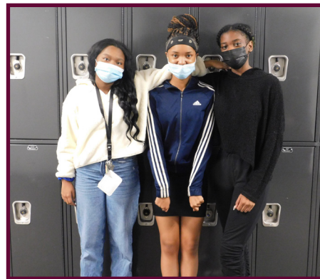
Maple students dress up for Friday Spirit Day.