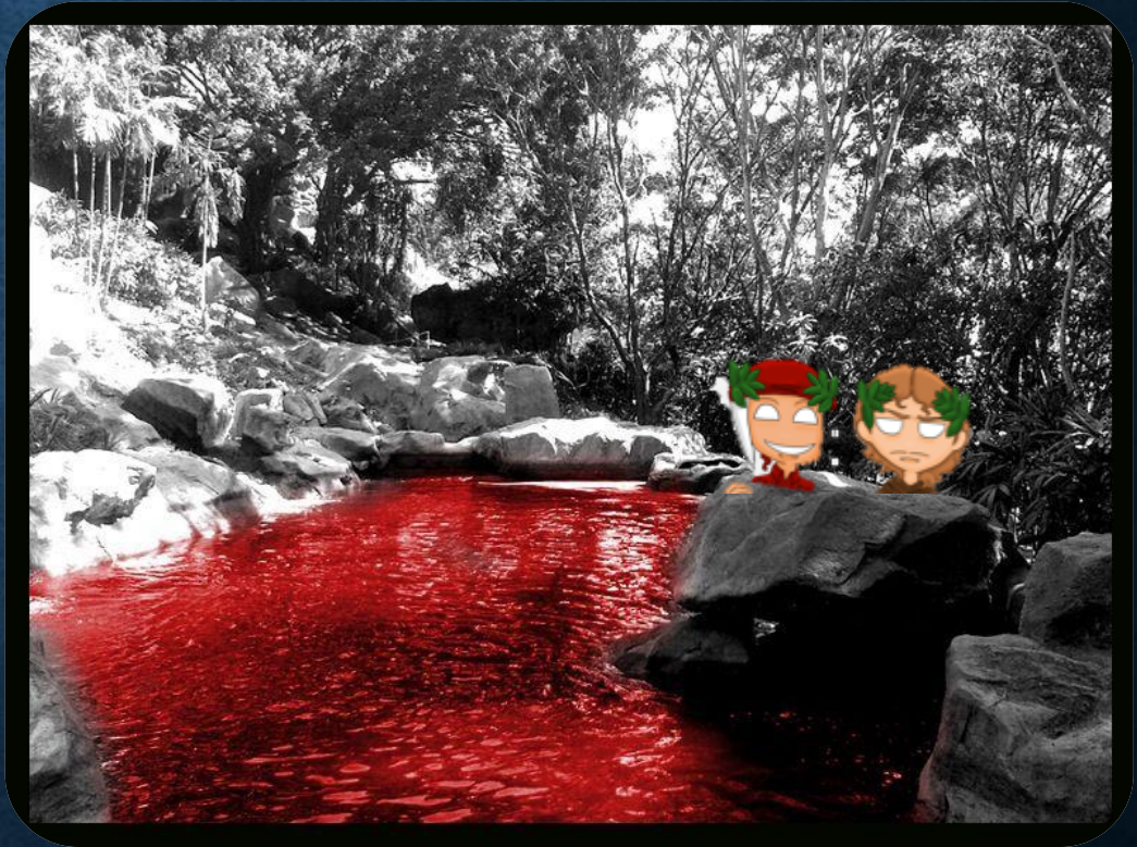
Boiling bloody river, Guarded by Minotaur