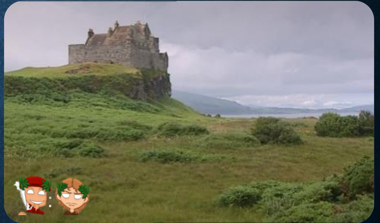
Castle w/7 walls & Meadows