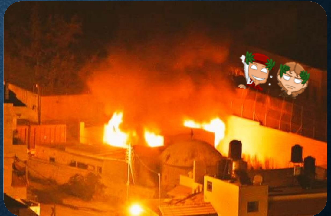
Burning Mausoleums, Satan's City of Dis