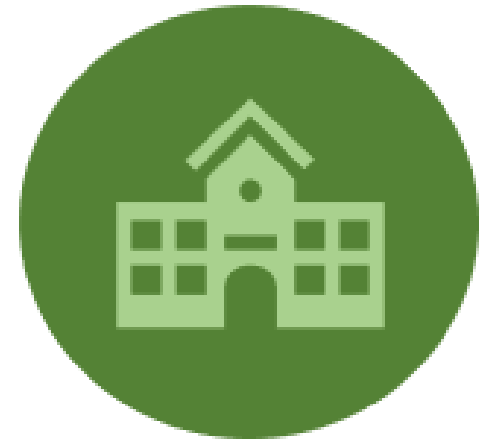
Governance and Management