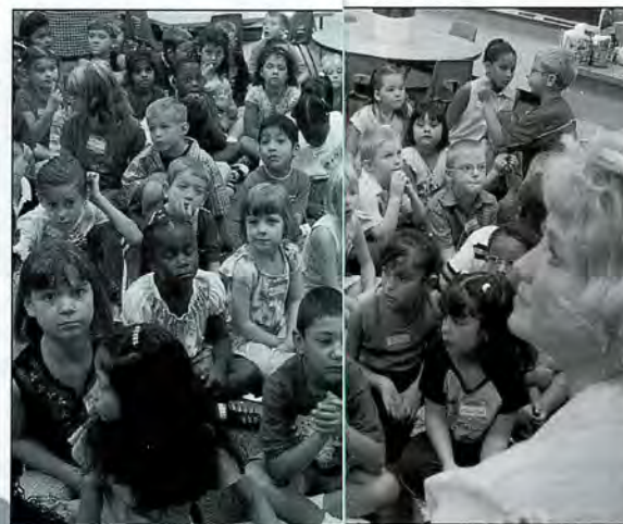
Classroom space is at a premium in Union Public Schools as enrollment continues to increase. The addition of a new elementary school will help alleviate student crowding.

Families continue to choose Union Public Schools as the best place to educate their children. In fact, our student enrollment has climbed by more than 300 during this school year. The primary focus of this year's bond issue is classroom space for new elementary students and the expanding programs that will be most beneficial for them. Currently, the enrollment in six of our eleven elementary schools - Boevers, Briarglen, Grove, Jarman, McAuliffe, and Moore - exceeds the ideal capacity. Building another elementary school will allow us to better balance building sizes and make room for all-day kindergarten programs at all elementary schools.