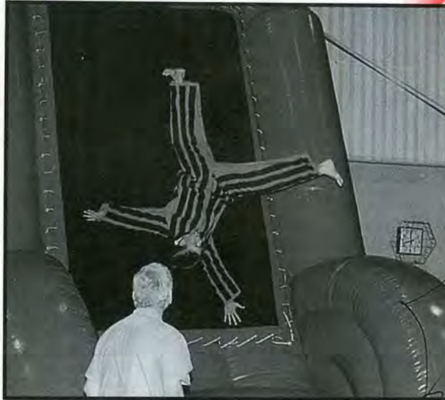
Hang in there!! The Velcro Wall was a big attraction during Graduation Celebration.