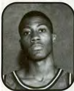
Osric Woods Basketball