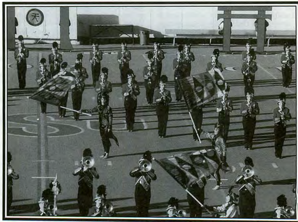
The Union Renegade Regiment's interpretation of "Gloriosa" depicting the struggle of Christianity in Japan, earned national recognition.