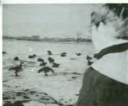
McAuliffe has gone to the birds, or so it appeared January 10 when a flock of Canadian geese decided to take a rest stop on the playground. Students visited the geese throughout the day feeding them popcorn and leftovers from lunch.