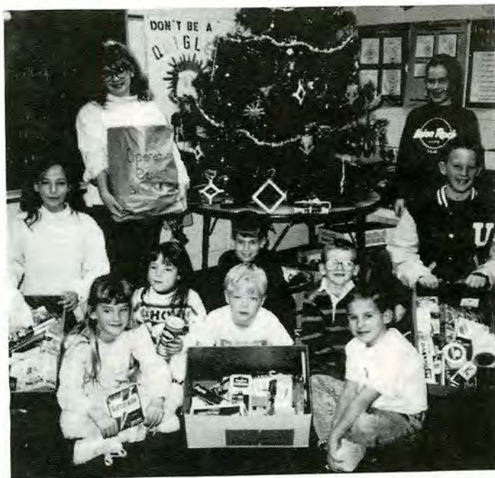
As did several Union school children, Darnaby first and fourth graders sent Christmas gifts to the troops.

At Andersen the cafeteria wall is decorated in red, white, and blue and bears the names of Andersen friends and relatives serving in the Middle East. The Seventh Grade Center, Junior High, and Union's other elemen-