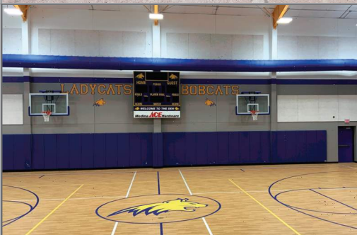
Completed Multi-Purpose Building 01.06.2020