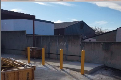
Propane Tank Concrete Pad 01.06.2020