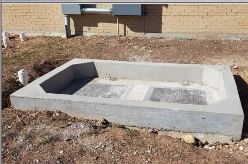
Grease Interceptor 01.06.2020