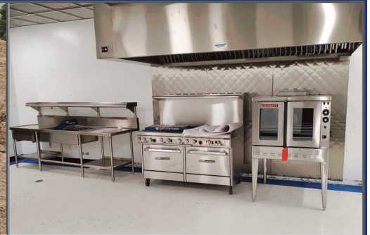
New Culinary Lab Equipment 01.21.2020