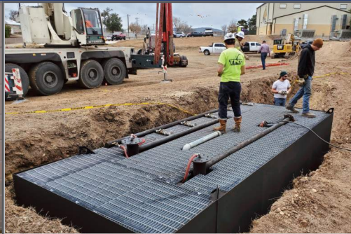
New Sewer Plant 01.15.2020