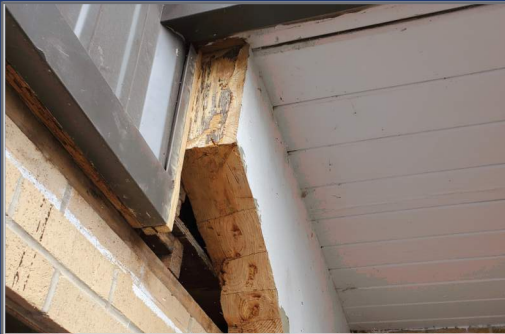
Exterior Beam Repair 01.15.2020