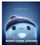
Ron's Gone Wrong