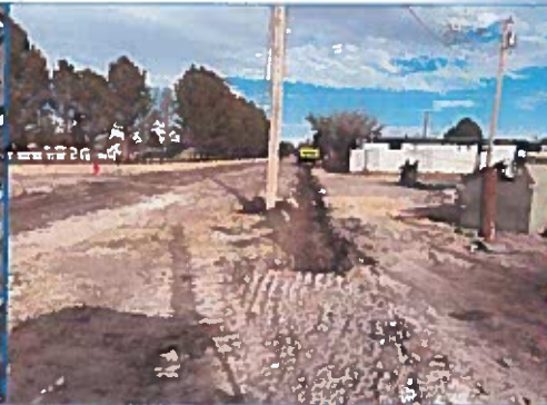
Offsite Utilities Excavation and Replacement Upgrades _ 01.07.2022