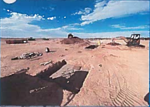
Poured Foundation Footing _ 12.08.2021