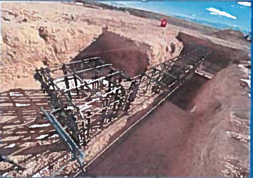
Foundation Reinforcing Steel _ 12.08.2021