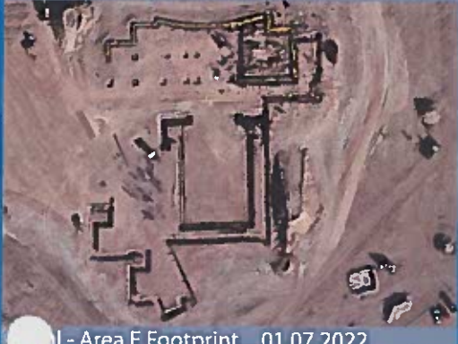
Area E Footprint _ 01.07.2022