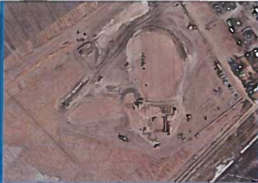
Overall Aerial _ 01.07.2022