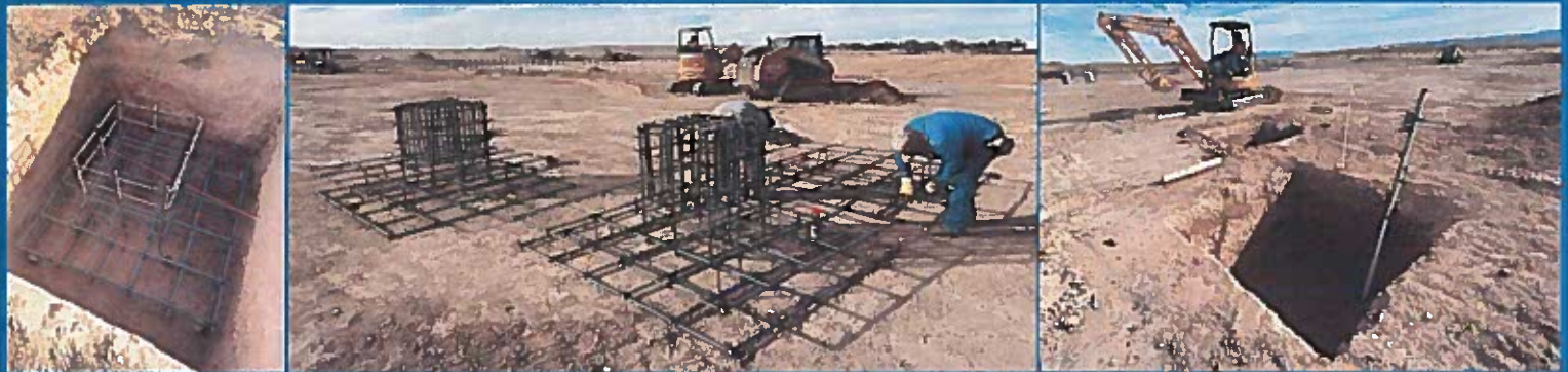
Installation of Spread Footings: Excavation into Select Fill, Tying Rebar Cages, Placing Cages in Opening - Area E _ 11.22.2021