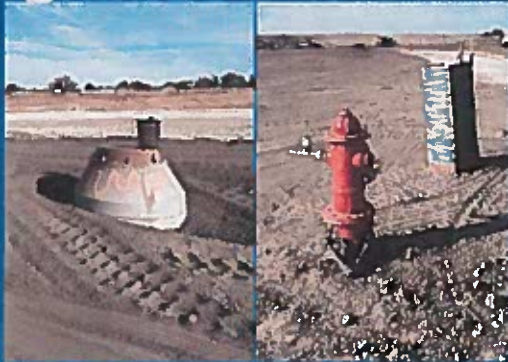
Site Fill at Utilities _ 11.22.2021