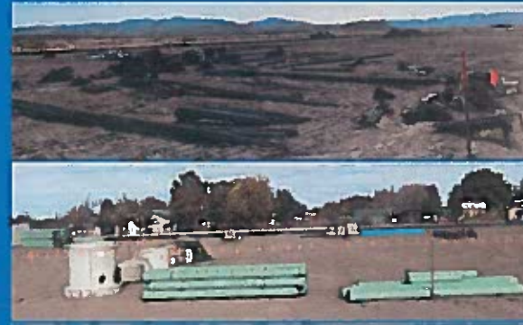
Steel Rebar, PVC Piping, Cast Concrete _ 11.22.2021