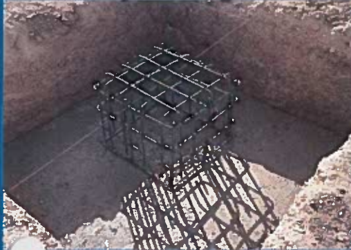
Concrete Poured for Footing _ 11.22.2021