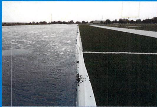
Track & Field, Track Installation - 07.13.2022