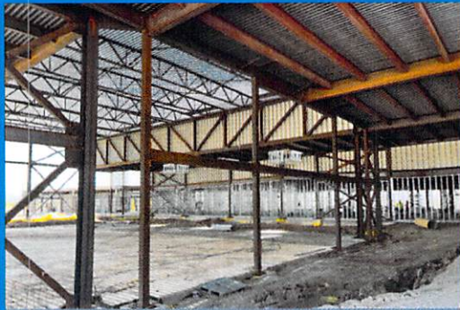
Area 'E' Metal Stud Framing - 07.20.2022