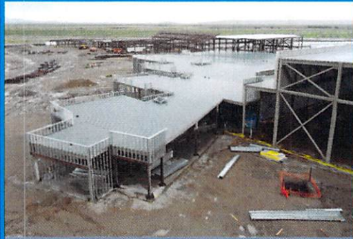
Area 'C' Deck & Metal Studs - 07.13.2022