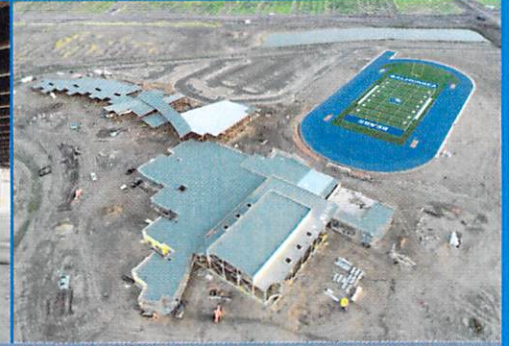
Aerial Looking Northwest - 07.22.2022