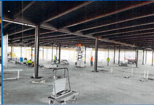
Area 'C' Slab & Metal Stud Layout - 07.20.2022