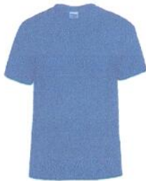
ROYAL BASIC SHORT SLEEVE T-SHIRT