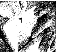
independent living skills