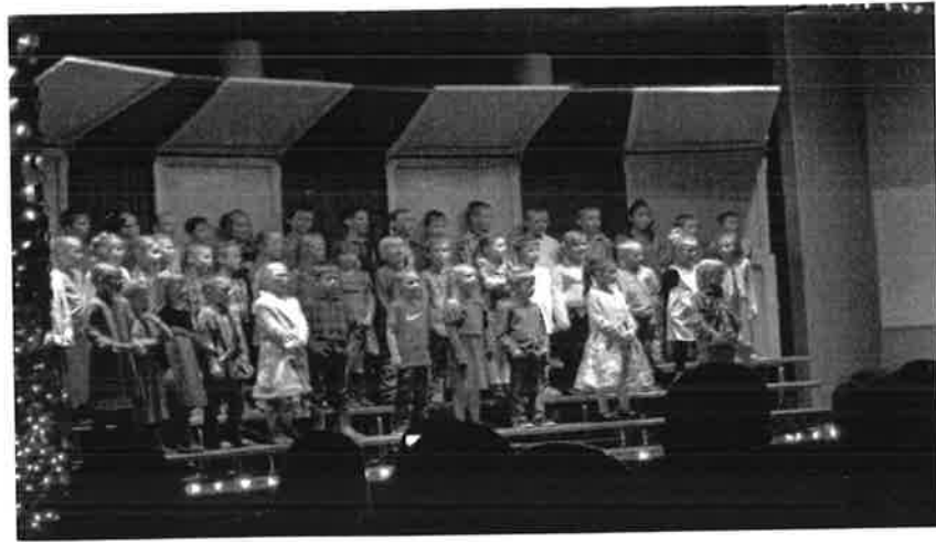
Moorcroft K-8, second grade students preformed a Christmas song for the audients during the school Christmas concert.