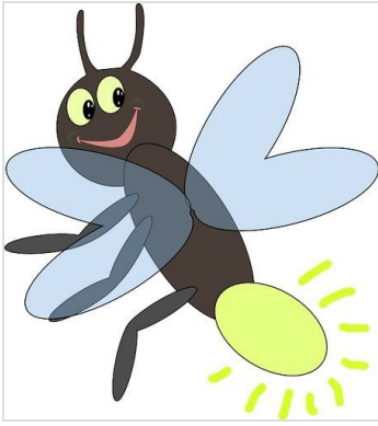
This is a drawing of a firefly.

Fireflies are beetles that glow! Fireflies are black beetles with big eyes. Most fireflies have wings. They can light up in the dark. Even the eggs of fireflies glow!