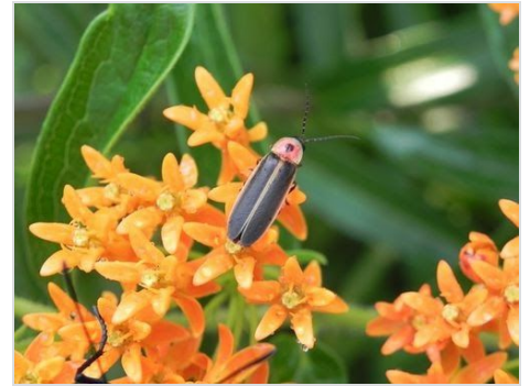
This is a photo of a firefly on a plant.

Why do fireflies light up? Sometimes, animals want to eat fireflies. Fireflies light up to tell these animals that fireflies taste bad. When a firefly is scared of something, it lights up. Other times, male and female fireflies talk to each other by lighting up. They can blink on and off.